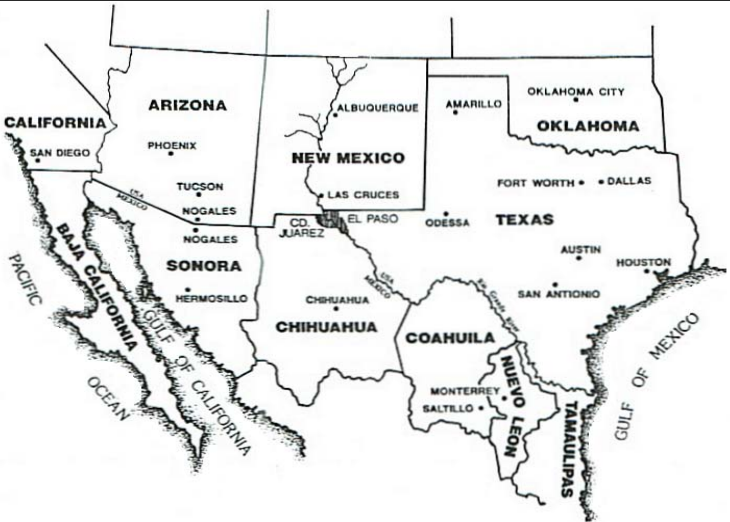
Map 1: The U.S.-Mexico Border Region

With the proximity of the University of Texas at El Paso and the location of an Instituto Tecnológico de Monterrey campus in Ciudad Juárez, along with numerous maquilas, the city has enough engineers warrant the location of a technical center in Ciudad Juárez. Seventy-five percent of the engineers employed in the technical center are Mexican nationals, with the remainder primarily from the United States. 115 In addition to the presence of qualified engineers, the pay scale for those engineers, as in other professions, is lower in Mexico than it would be just across the border in the U.S, often one-half the rate paid in the U.S. From an efficiency standpoint, Delphi