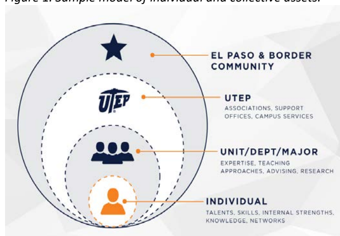
Figure 1. Sample model of individual and collective assets.

Asset-based Teaching and Learning (ABTL) recognizes the strengths, skills, and resources of learners, using them as a starting point for learning. This approach toward pedagogy can take place within the classroom (a site of explicit teaching and learning) or within any space where explicit or implicit teaching and learning takes place (such as the workplace). For the purposes of this paper, the focus is on asset-based approaches to pedagogy within postsecondary classrooms. Asset-based Teaching and Learning is defined by five distinct characteristics which represent an outgrowth of the educational research and learning theory that underpin it. Figure 2 below provides a visual representation of these characteristics, which include: